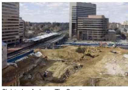
A view from the top of a nearby office building of the construction underway at the Silver Spring Transit Center at Colesville Road and Wayne Avenue in Silver Spring. Underground rock blasting has been underway for the past few weeks, to be followed by the first glimpses of the foundation and structure for the center. Expected opening date is June 2011.

To account for the delays and a reduction in state aid, about $6.6 million in additional transit center funding for fiscal 2012 was recommended last week by the county council in Capital Improvements Program deliberations.