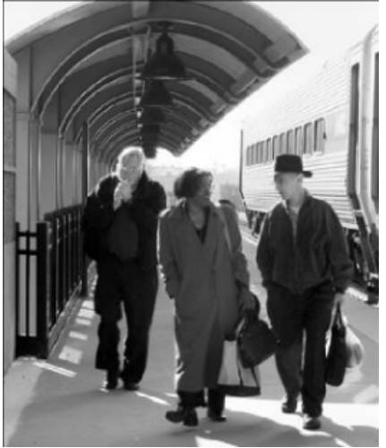
Commuters exit the new MARC commuter train station on Tuesday in downtown Silver Spring.

The transit center is a component of the redevelopment of downtown Silver Spring.